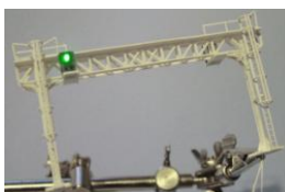
GN02HH - Twin Track Gantry