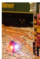
SN17 - 3 Light Shunt Signal