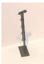
LN30 - Period Double Yellow Yard Light