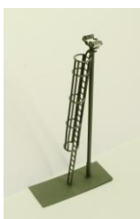
LN15 - Modern Double White Yard Light