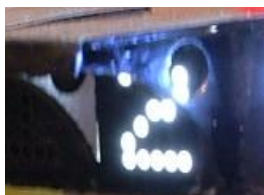
TH & KN16 - Theatre Indicator Unit