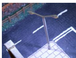
LN03 - Modern Double White Street Light