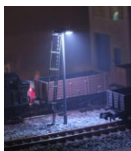
LN29 - Period Double White Yard Light