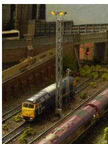
LN34 - TPM Period Yellow Lighting Rig