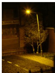
LN02 - Modern Single Yellow Street Light