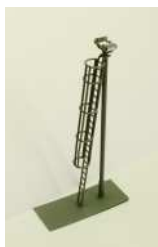
LN15 - Modern Double White Yard Light