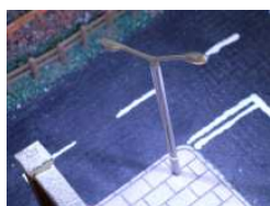
LN03 - Modern Double White Street Light