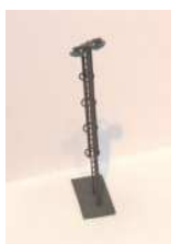
LN30 - Period Double Yellow Yard Light