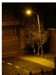
LN02 - Modern Single Yellow Street Light