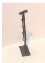
LN30 - Period Double Yellow Yard Light