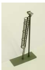
LN15 - Modern Double White Yard Light