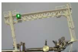
GN02HH - Twin Track Gantry