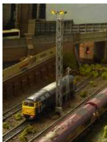
LN34 - TPM Period Yellow Lighting Rig