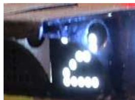
TH & KN16 - Theatre Indicator Unit