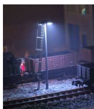
LN29 - Period Double White Yard Light