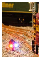
SN17 - 3 Light Shunt Signal