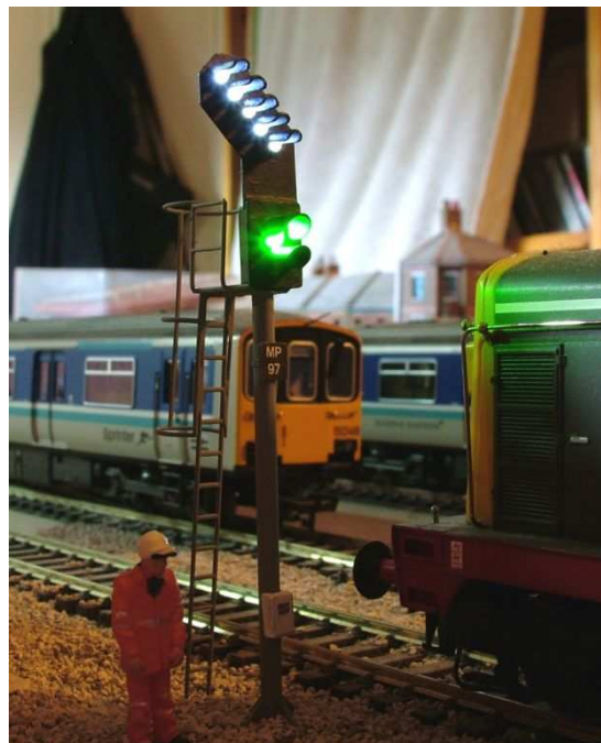
SO12HCROI01 – OO Gauge 2 Aspect Signal with Pos 1 RI