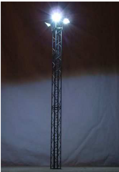
LO20W – OO Gauge TPM Modern White Lighting Rig