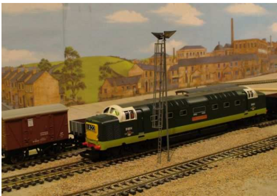
LO15W – OO Gauge Modern Double White Yard Light

Our product range is continually expanding when time permits for development work. The pictures below are a selection of our product range. We offer a 100% satisfaction guarantee. If you don't like the item you receive, we offer a full refund for items returned in as new condition.