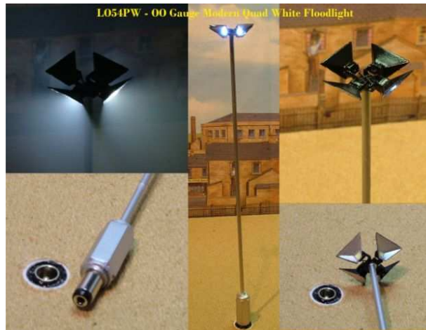
LO54PW – OO Gauge Modern Quad White Floodlight